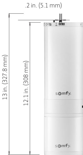
Motor and Battery