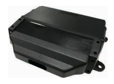
Front view without the cover